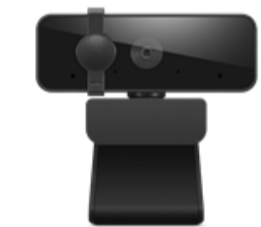
Lenovo 310 FHD Webcam Black